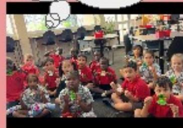
Year 1 hebi (snake) puppets

あけましておめでとう へびどしです AKEMASHITE OMEDETOU HEBI DOSHI DESU